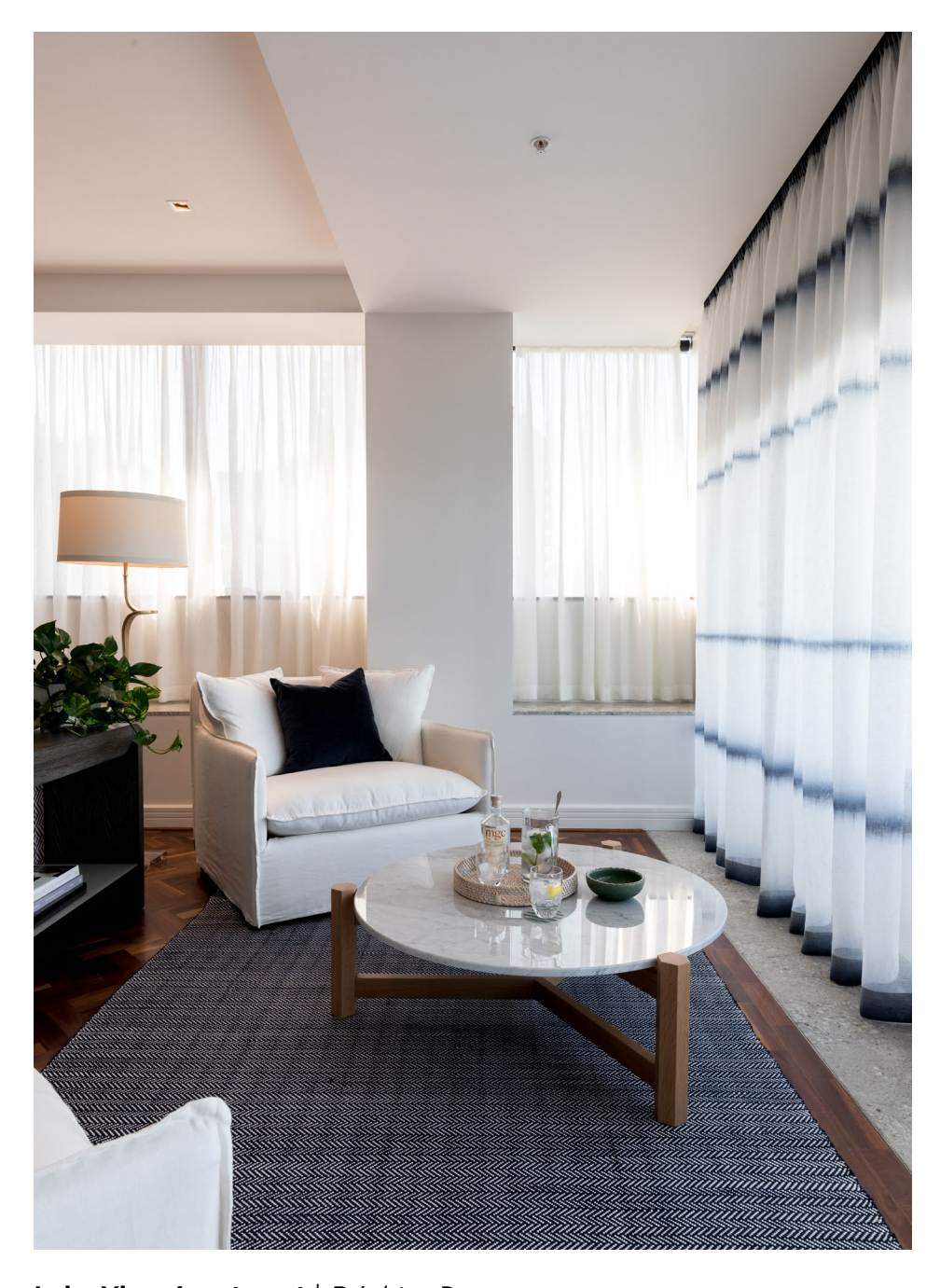
Lake View Apartment | Brighter Days

Light filtering and sheer, bespoke floor to ceiling curtains with indigo ink-wash detail. Custom navy velvet cushion on luxurious linen armchairs in ivory, finished with a 1.5cm flanged edge.