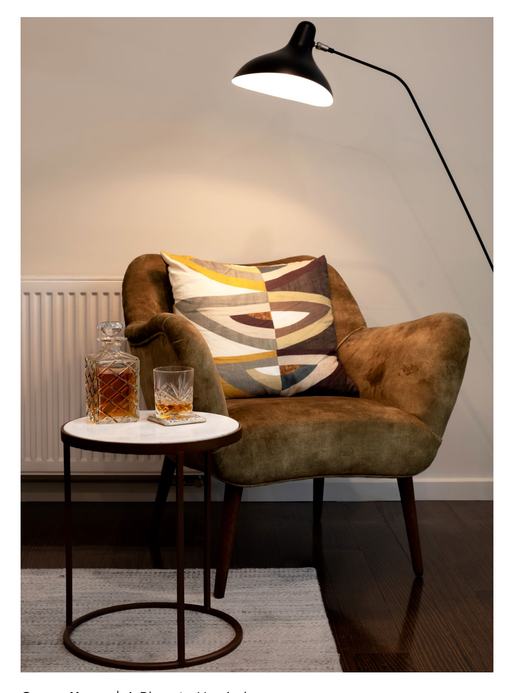
Cressy House | A Place to Unwind An occasional chair upholstered in caramel coloured velvet, paired with a custom-made cushion in a bold, organic print.