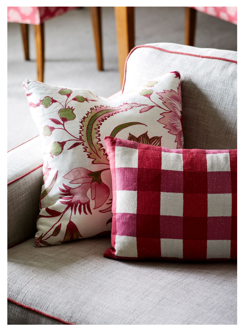
Treetop Residence | Pattern Mixing, Colour Matching Custom cushions in oversized, magenta check and botanical print on a much loved sofa that has been reshaped and reupholstered in a natural linen complete with a pop of chili red piping.