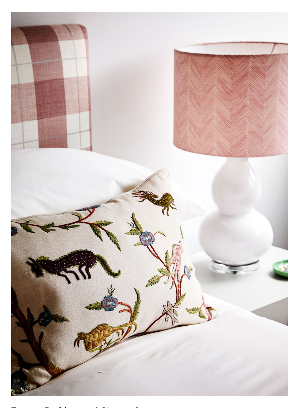
Treetop Residence | A Place to Dream

A bespoke, upholstered bedhead in a pink and metallic silver pin-stripe plaid with a gourd lamp and custom shade in hand-printed, blush herringbone print. Crisp white luxury bed linens finished off with a gorgeous, hand-embroidered fantasy forest cushion.