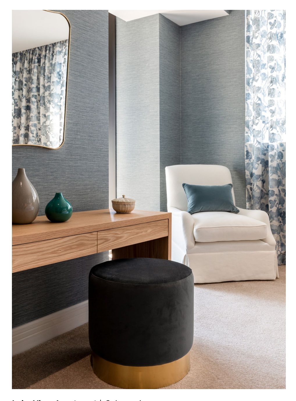
Lake View Apartment | Calm and cosy

A velvet ottoman set atop a circular brass base. A custom mid-blue cushion on an upholstered occasional chair with French-pleated skirt, set against delicately embroidered, sheer curtains.